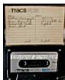
WILLIAM BURROUGHS (a conversation with friends ) 74